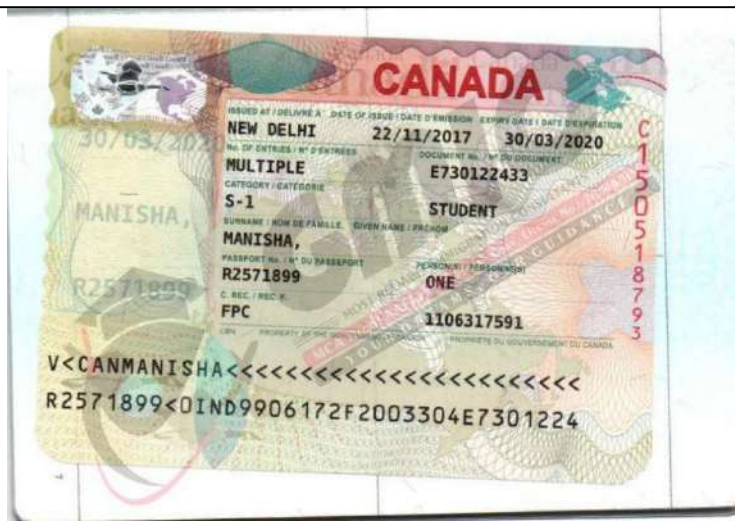
MANISHA: COLUMBIA COLLEGE