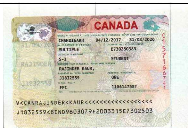
RAJINDER KAUR : SELKIRK COLLEGE